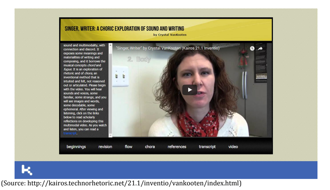
Figure 3. A screenshot of the first article in Kairos 's issue 21.1/2016

Figure 3 is a screenshot of a research article included in the journal's first 2016 issue. The video, which is a main component of this research product, is foregrounded at the center of middle and above sections of the page whereas the text organization and navigation ( beginnings , revision , flow , chora , references , transcript , video ) are included at the bottom section as background.