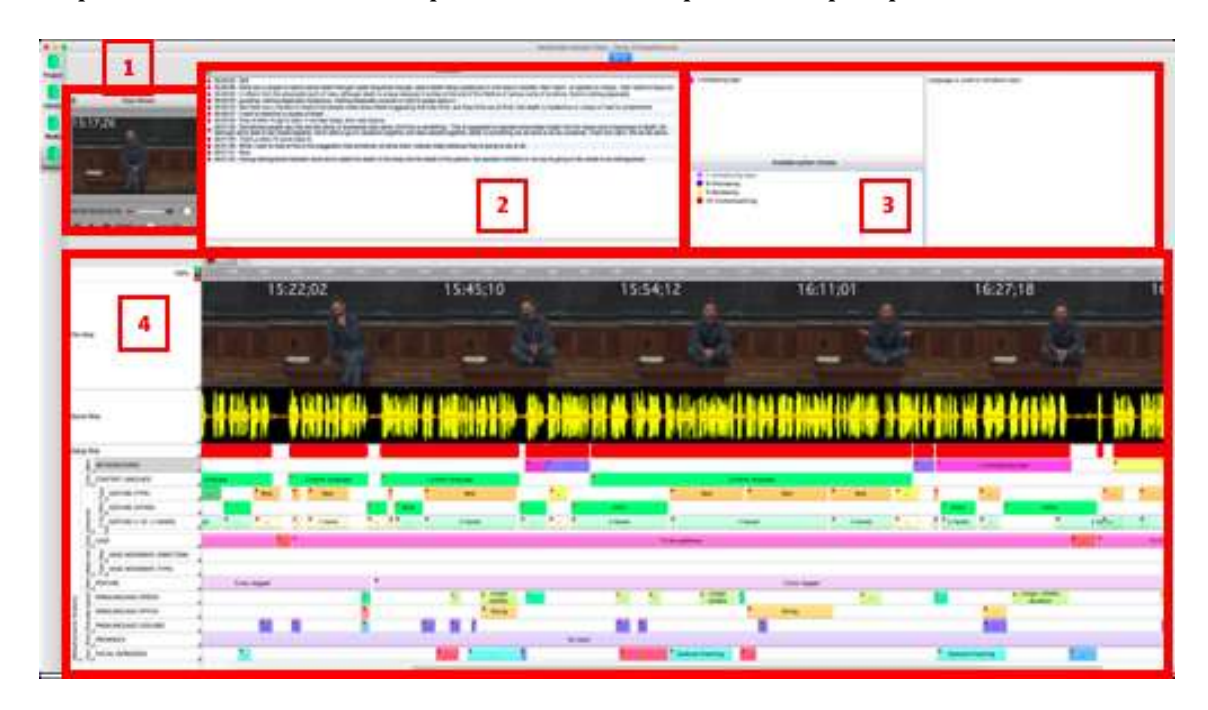
Figure 2. MMA-Video's interface

the microanalysis of the modes using MMA-Video offers a comprehensive review on the use of multimodal resources both in structuring segments and in content sequences, and both from a quantitative and a qualitative perspective.